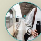
'Deal seekers that love Tiffanys'

Build highly complex audiences for unique 'white space' by combining categorized, custom and competitive audiences.