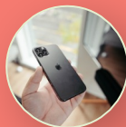
'Financial Empowerment Seekers'

Tailored audiences per campaign for clever engagement, efficiency, and to gain competitive advantage.